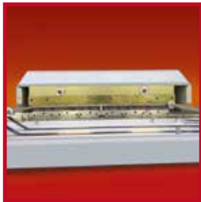
Punching tool ES