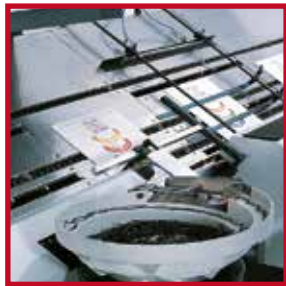
The PB-796 HD ES BF working with automatic 70 mm. hanger feeder